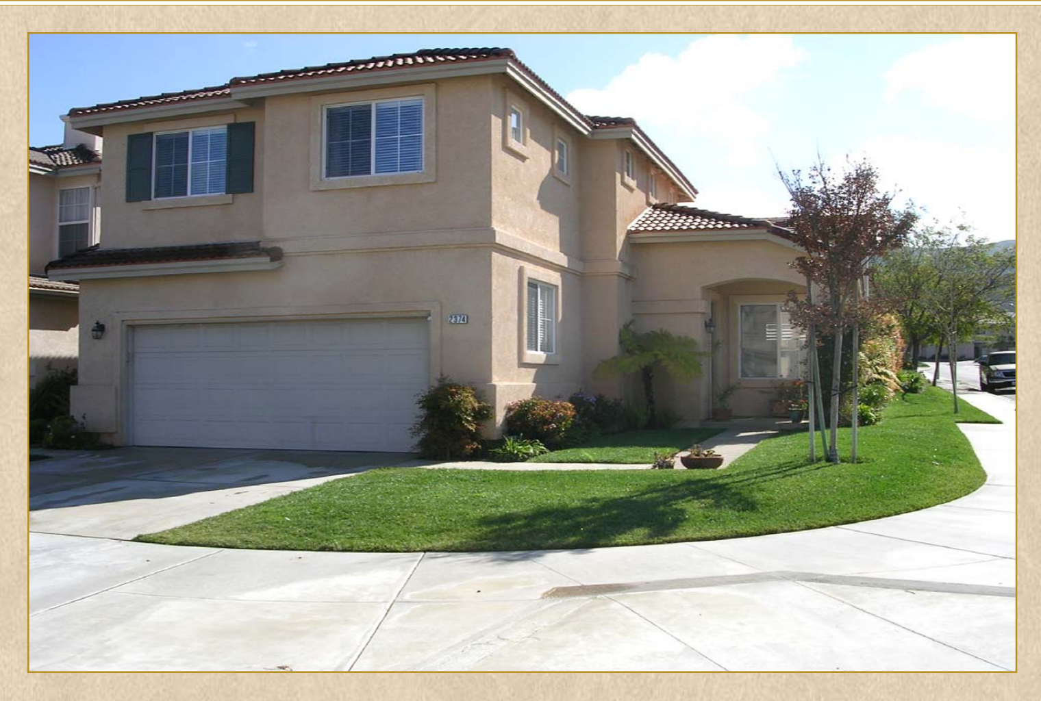
2374 Faos Avenue, Ventura, California Offered at $689,000