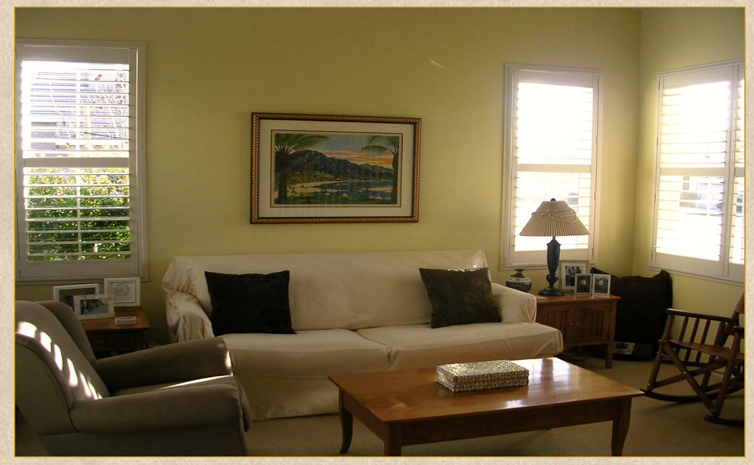
Information presented here is deemed reliable but is not guaranteed.